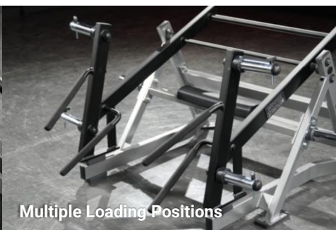
Multiple Loading Positions