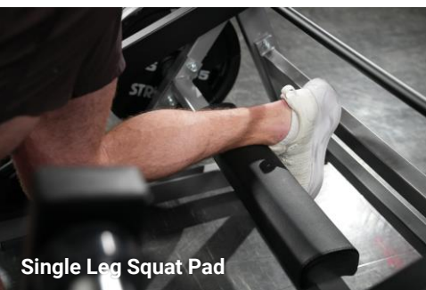
Single Leg Squat Pad